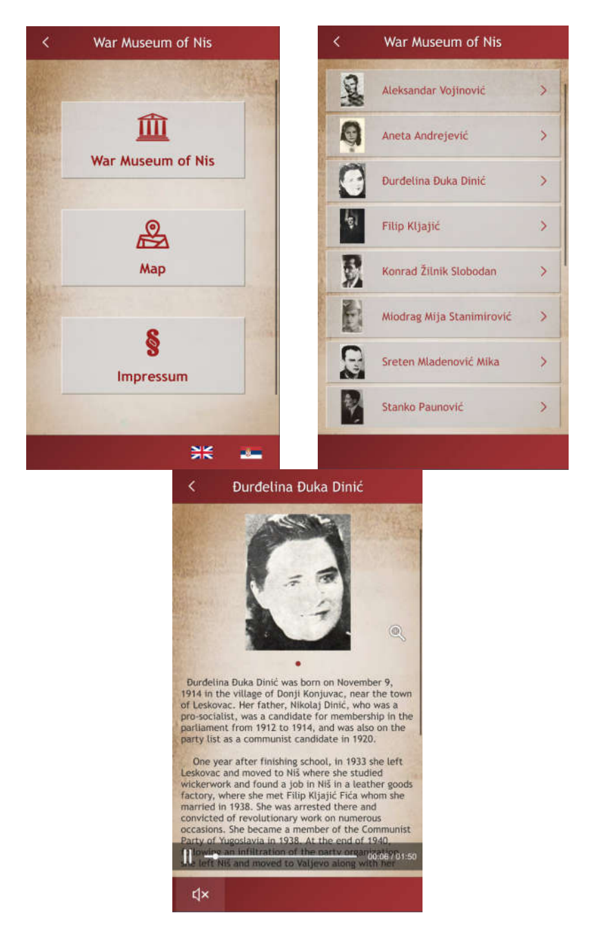
Figure 2. Mobile application a) left image application menu b) list items of war heroes and c) detailed information in form of text, photos, and sound.

Choosing the map option, shown in Figure 3, the Google map opens with interactive pins, where each pin represents one monument. More detailed information about the monument will be shown if the visitor touches the pin. The visitor can select the navigation option for each monument of interest and then the path from the user's current location to the selected monument will be drowned.