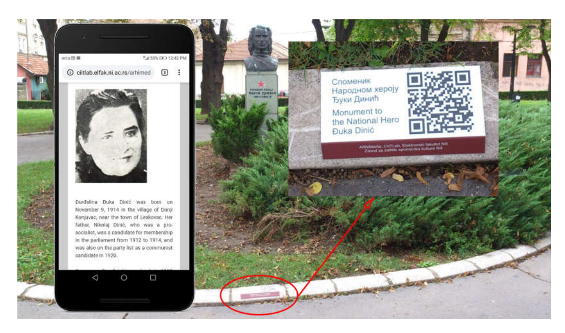
Figure 1. Monument to the National Hero Đurđelina Đuka Dinić marked with a QR code

Mobile application is aimed to be installed from the mobile stores via QR placed on touristic booklets, billboards near the entrance of the parks, and other touristic locations in the Niš city. It can be also found by retrieving Google Play and App Store with the name of the application. Once installed the application enables the visitor to have a complete tourist guide through the War Museum of Niš under the Open Sky.